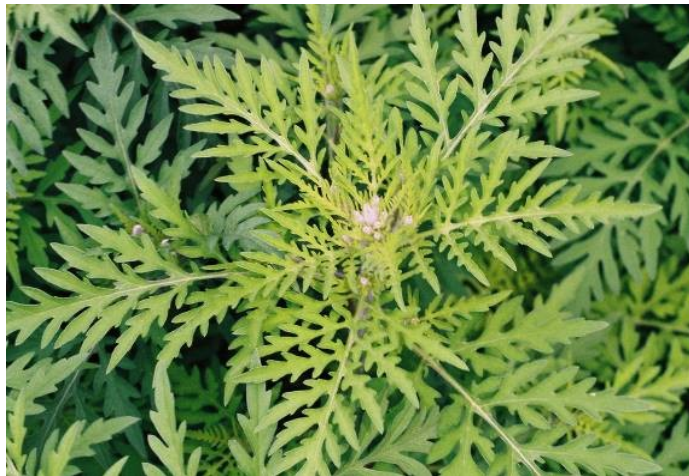
Typical leaves in young plant of common ragweed ( Ambrosia artemisiifolia )

Mainly common ragweed produces large amounts of pollen that is highly allergenic and can result in severe reactions like asthma. Due to the late flowering, ragweed makes seasonal allergic patients suffer longer in the season.