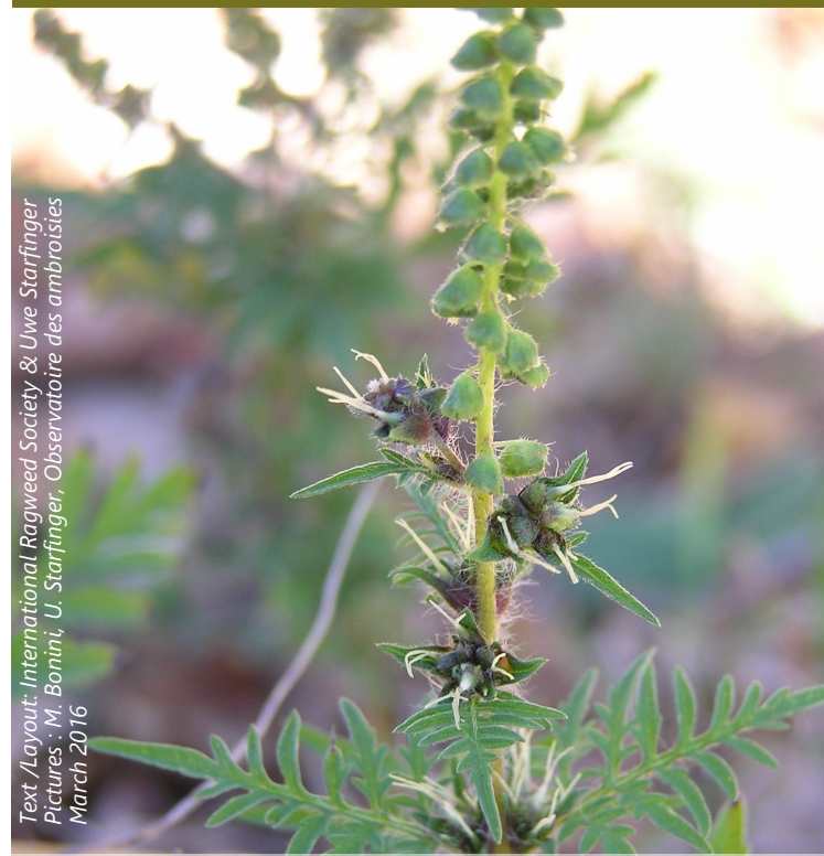
Female and male flower head of common ragweed ( Ambrosia artemisiifolia )